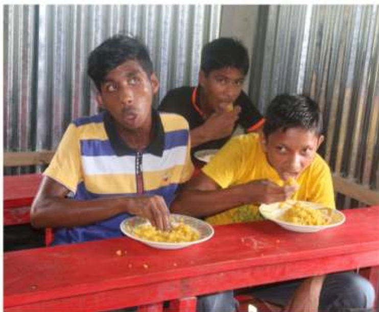
Autistic students taking their lunch in school.