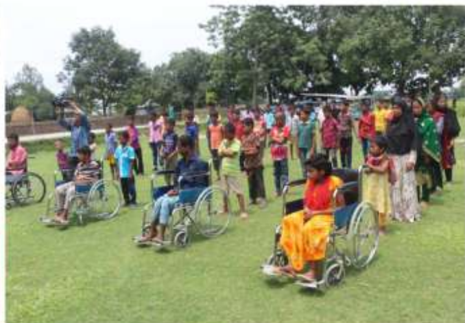
National song celebrated by the Autistic students in front of school field.