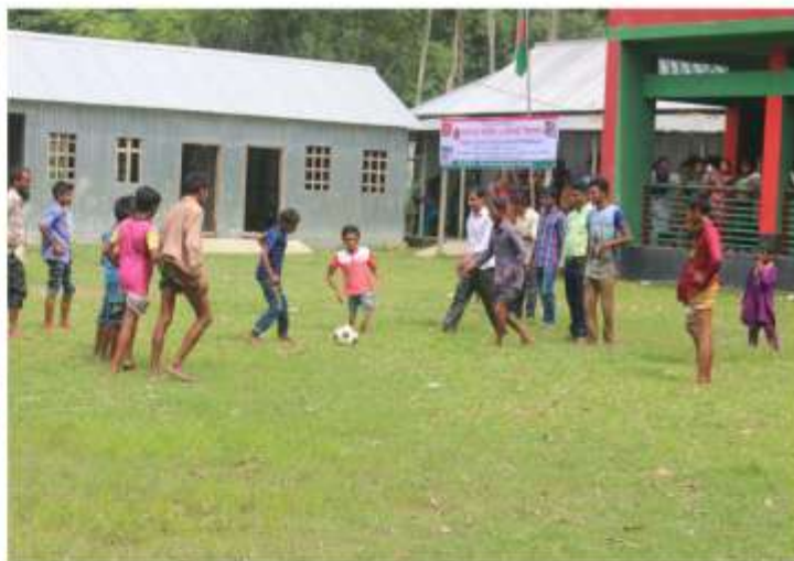
Autistic and disabled students are playing football at school grounds.