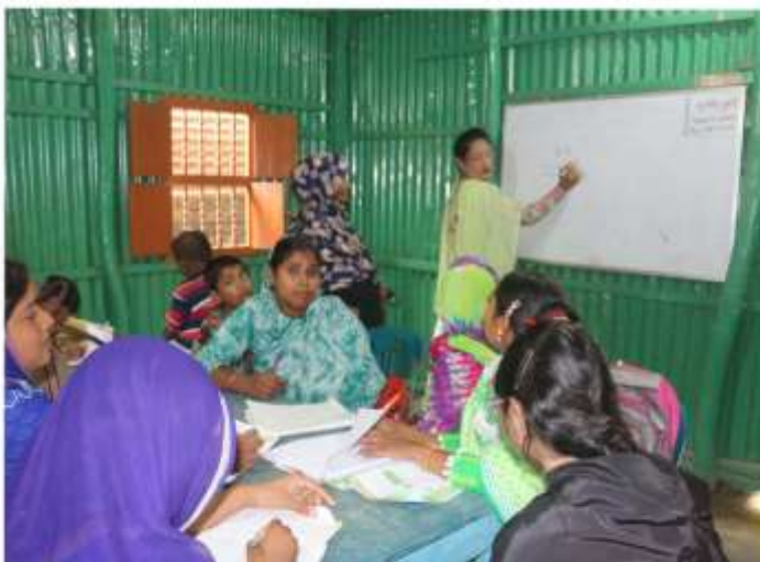
School teacher taking class of Autistic students.