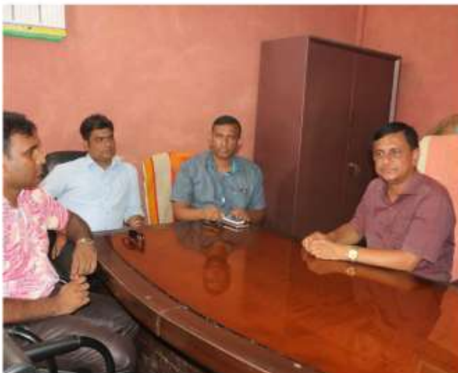
Chairman conducting meeting with the Executive committee members..