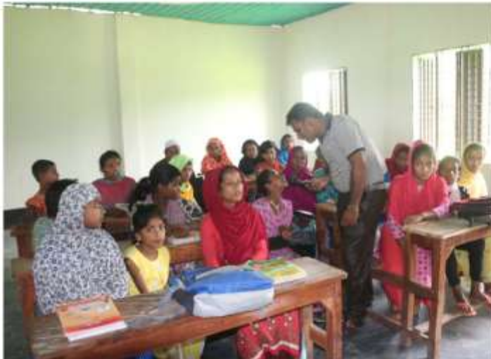
Autistic Students class room.