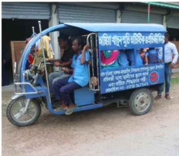
Autistic students school transport.