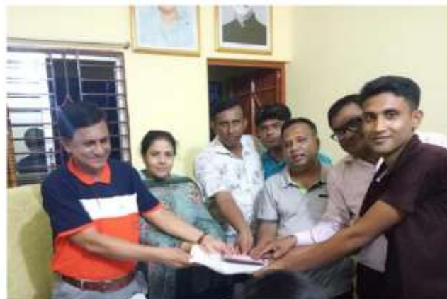
Chairman distributing credit to the group members.