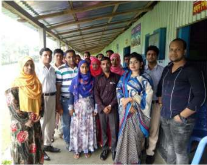
Autistic school visited by the guest of America Embassy, Dhaka..