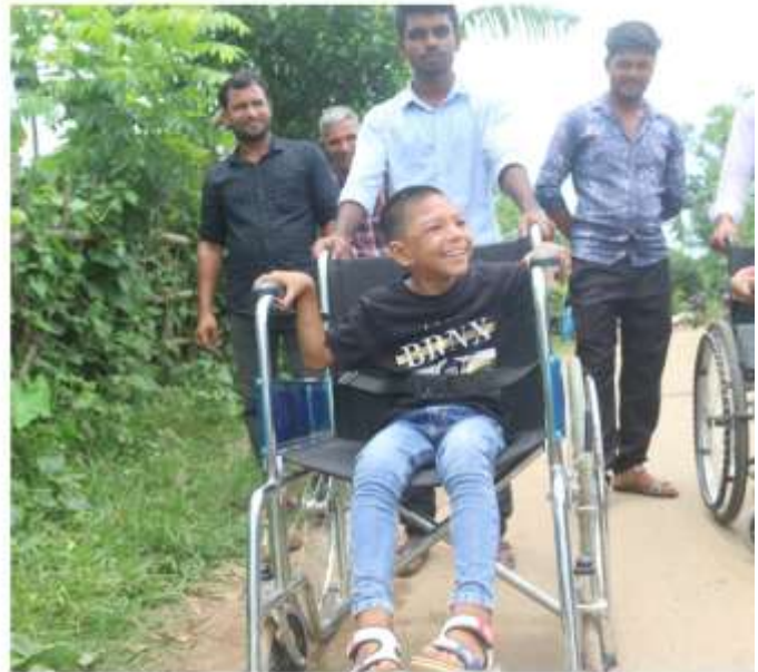
Autistic student are going to school.