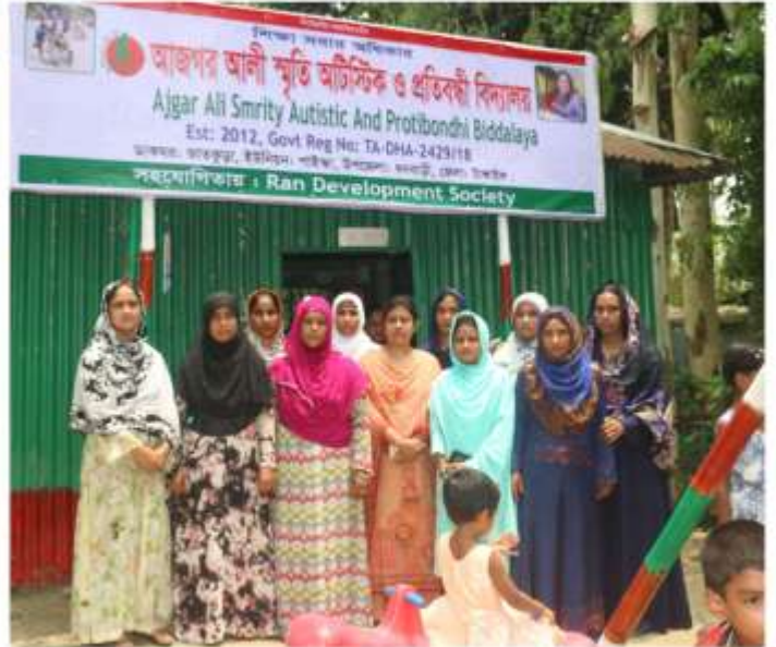
Autistic School Teachers and Staff.