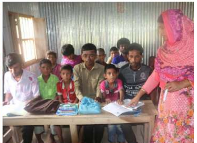
Teacher takes classes in Autistic students.