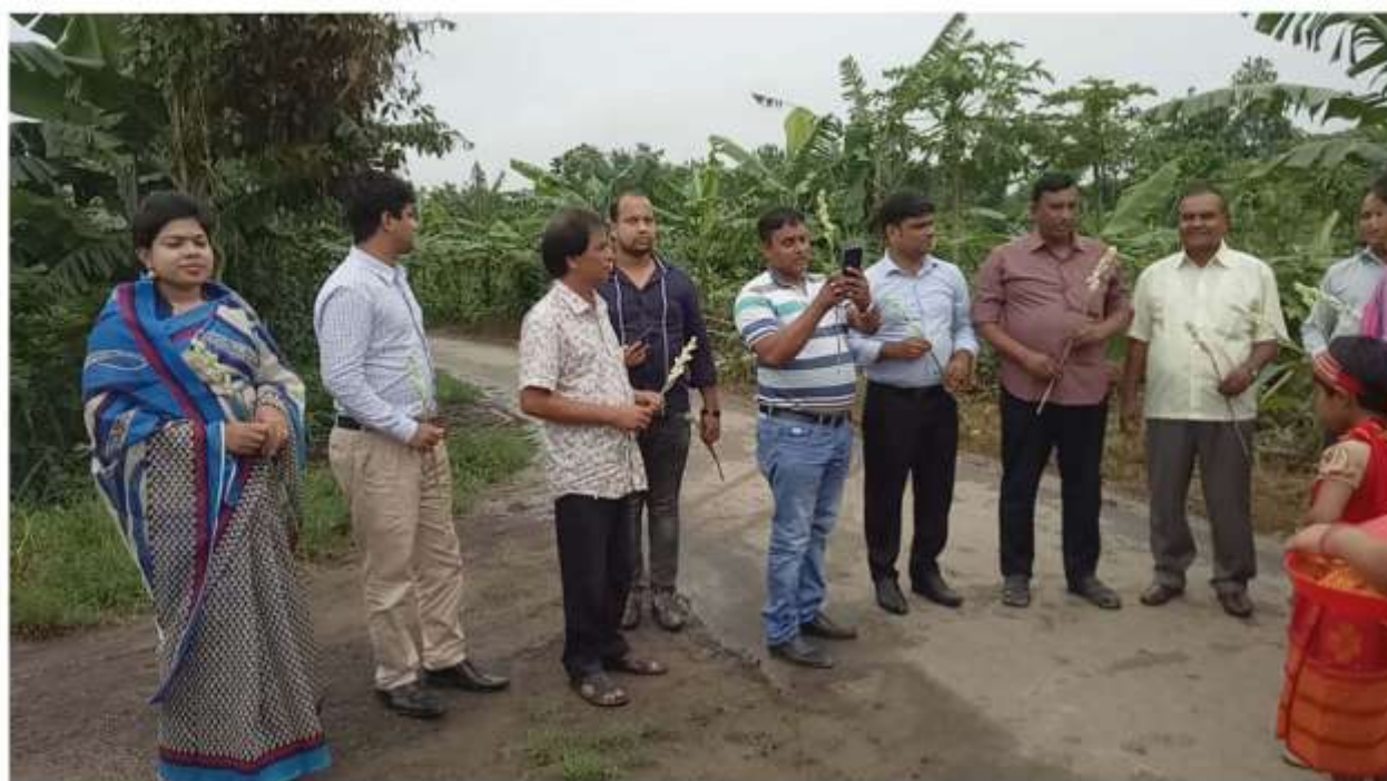
Autistic students of tribale family offering flower to the guest of America Embassy and Guest of Ran Development Society