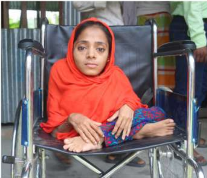
CWDs student moving toward to the school.