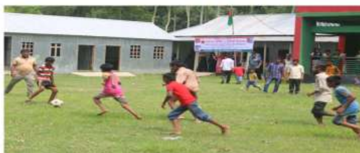
Autistic students are playing football in the school field.