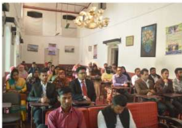
Training on Disability understanding issues.