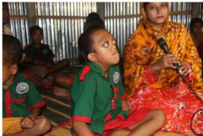
Autistic students are taking classes in the class.