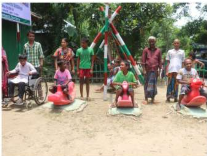
Students with disabilities are rowing in the school premises