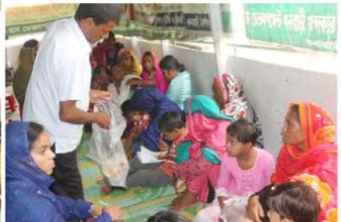
Tiffine distributed among the Autistic Students.