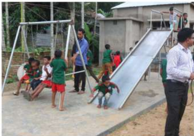
Autistic students are entertained at school.