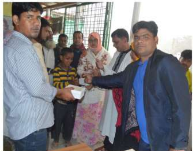
Food distribution among the PWDs & Autistic Children's.