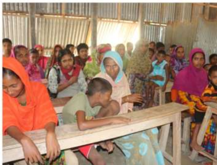
Autistic Students Class room.